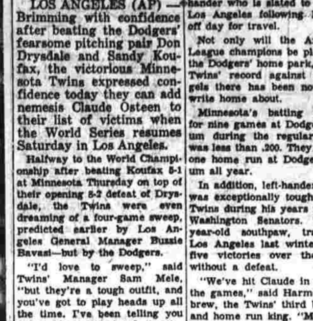
LOS ANGELES (AP) - Sandy Koufax

LOS ANGELES (AP)—Minnesota's Jim Kaat turned out to be the mouse that roared. A definite underdog when he took the mound against Los Angeles' peevish Sandy Koufax in a battle of left-handers Thursday.